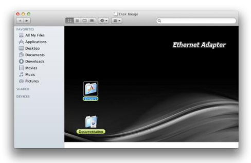
*Note: Actual image may vary

3. Double-click "USB 1000M" folder, and then double click the "USB 3.0 1000M" folder, then click "For Mac OS X 10.6/10.7/10.8" file to launch the installer.